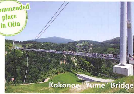
Kokonoe "Yume" Bridge

I want to invite my friends from home and surprise them!